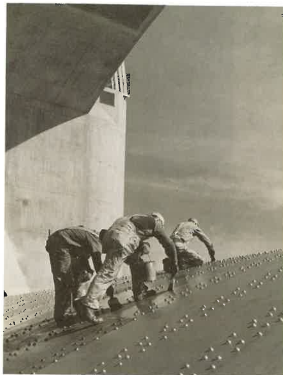
In 1931, construction began on a massive public works project: building Boulder (later renamed Hoover) Dam across the Colorado River. The government employed 21,000 workers, who completed the dam in just five years. Liberals favored increasing government spending on such projects to create jobs for the unemployed.

Radicals viewed events like the Bonus Army protest as opportunities to spread their ideas. They encouraged working-class people to rise up against the "greedy capitalists." As the Depression wore on, such ideas began to appeal to a growing number of disillusioned Americans.