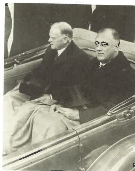
In 1932, Franklin Roosevelt launched an ambitious campaign tour of the country by train. Roosevelt's efforts paid off when he won the election by a landslide. Here, Hoover and Roosevelt are travelling to Roosevelt's inauguration. There, Roosevelt delivers a speech reassuring the American people that "the only thing we have to fear is fear itself."

A gloomy Hoover warned Americans that a Roosevelt presidency could bring disaster. Federal meddling in the economy, he claimed, would stifle free enterprise. Despite Hoover's dire warnings, Roosevelt won a landslide victory. He tallied 472 electoral votes to Hoover's 59, with a margin of victory of more than 7 million popular votes.